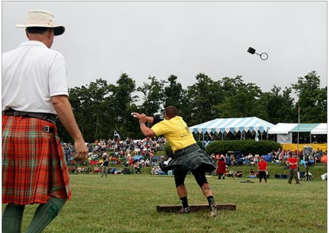
Heavy weight throw at Grandfather Mountain Highland Games

The 2013 Piper reunion will be held from Thursday, July 11 through Sunday July 14 at the Grandfather Mountain Highland Games in North Carolina. Headquarters for the reunion will be at the Shady Lawn Lodge in Newland, NC. There is a restaurant on the grounds and they have a meeting room we can meet in.